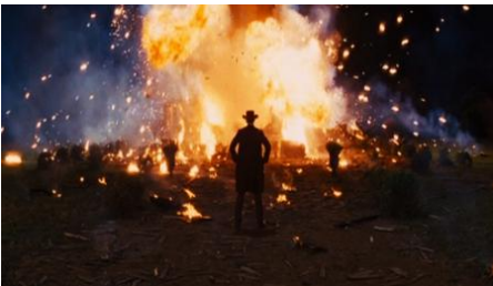
Figure 2: THE END.

Well, let us say that this is the beginning, not the end, of the story (oops I almost said “movie” here). Django can still be improved in a gazillion ways, including but not limited to: better variables ordering strategies; re-using state space information (e. g. dead-end regions) from previous iterations; adaptive paintings choosing red/black variables depending on state; etc. It should also be noted that Django is not doomed to just prove unsolvability – if the red-black plan in some iteration happens to be a real plan, then we can also stop. The question then is how to fruitfully interleave both purposes, choosing the next black variable, perhaps, based on the current hypothesis whether the task will turn out to be solvable or unsolvable.